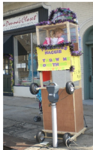
Design in action